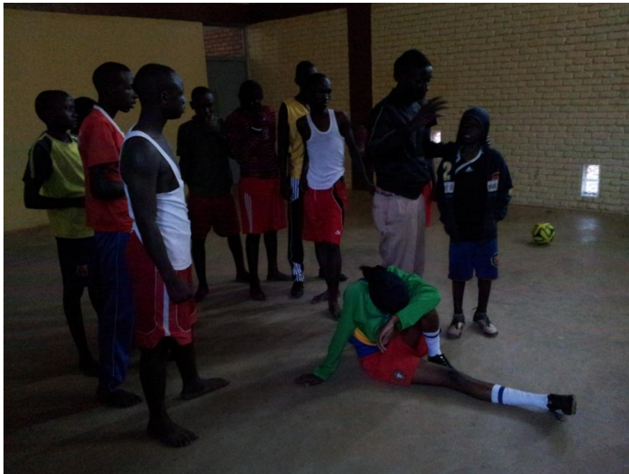
At Esperance the youth actors are presenting Football Forum Theatre about the need to stop discriminating against girls.