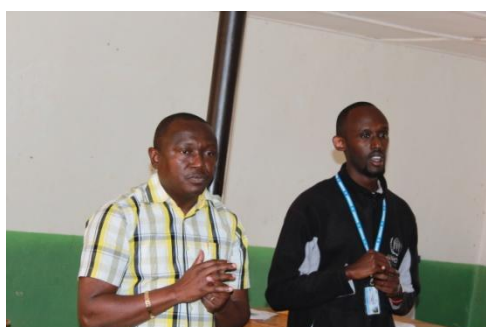
UNHCR Leadership of Gihembe Camp fielded questions after a day of workshops and visits