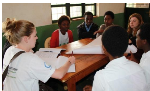
All women group discusses issues of importance to the young women in Gihembe Camp