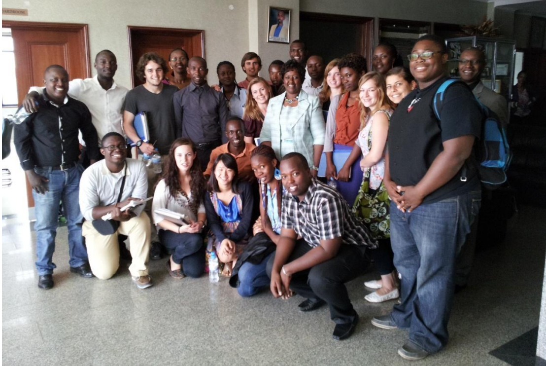
With the Rwandan Minister of Health after our engaging meeting on health and human rights.

Governmental agencies play an integral role in shaping the context in which grassroots organizations work in Rwanda. They also have the responsibility and ability to respond to the country's greatest challenges through the development and enforcement of laws and regulations, and effective allocation of resources. International governmental agencies, particularly the United States, play an important role in investing money towards development projects, and working with the local government to provide guidance. Through thoughtful questions posed by delegates and those we visited with, these visits shaped a thorough understanding of Rwanda and the region.