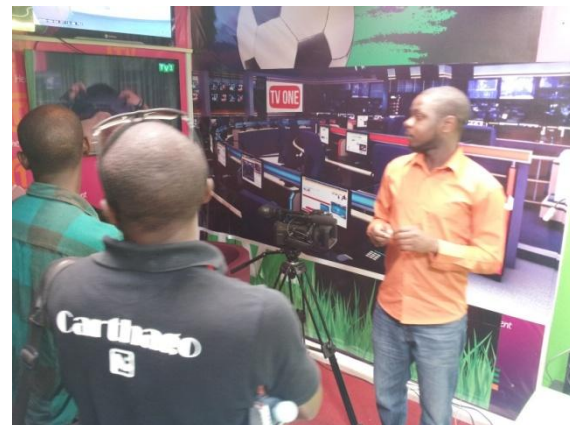
At TV1: A discussion about editorial priorities