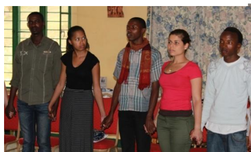
Workshop with members of the Kiziba Camp when they visited us at Karongi

Given that GYC had visited and worked with the Kiziba Camp for Congolese refugees for several years in the past, we decided to include a member of Kiziba in our program again, but also a member of the Gihembe camp. With two members (one woman and one man) the Rwandan and International delegates got a clear view of the situation facing refugees living in Rwanda. We visited Gihembe Camp, and we: