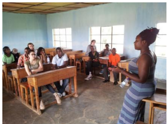
Participants had a discussion in one of the classrooms where the 1997 attack happened.