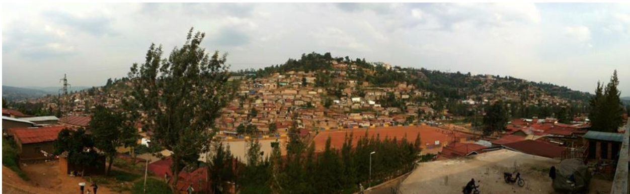
Kigali, Rwanda, as seen from outside INALAS' office, near the Kimisagara Youth Center.

2014 marked the 20 th anniversary of the 1994 Genocide against the Tutsi in Rwanda, but also the 20 th anniversary of the flight of genocidaires into the Congo, where they regrouped as the FDLR, a terrorist genocidal militia that has been fighting in and from the DR Congo ever since.