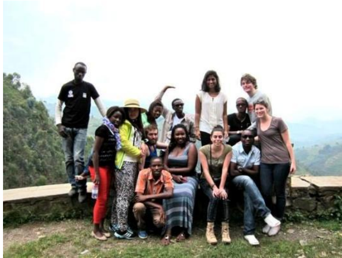
Participants visited Chutes Ndaba on the way to Nyange School.