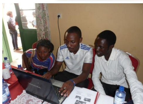
Social Media Training