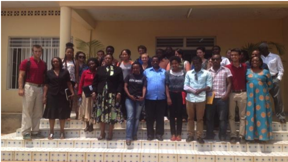
Meeting with all 7 Commissioners at the National Human Rights Commission

Governmental agencies and related institutions like the National Human Rights Commission play an integral role in shaping the context in which grassroots organizations work in Rwanda. They also have the responsibility and ability to respond to the country's greatest challenges through the development and enforcement of laws and regulations, and effective allocation of resources. International governmental agencies, particularly the United States, play an important role in investing money towards development projects and working with the local government to provide guidance. Through thoughtful questions posed by delegates, these visits helped shape a thorough understanding of the political landscape of Rwanda and the region.