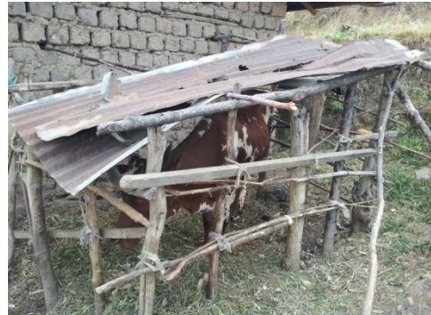
This cow was a gift of the government but it is suffering in the community of "Potters". Pots are not lucrative enough to buy grass for feed.