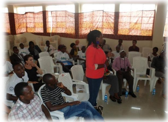
After a collective reading of the Universal Declaration of Human Rights, the delegates presented in the 4 teams that they had been working for the past three weeks:

(1) Documentation; (2) Blogging and Social Media; and (3) Theatre.