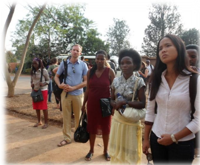
At the ETO Kicukiro school, where UN soldiers safeguarded, but then abandoned thousands to a death march and massacre.

The most important thing that I have learned is that all countries have human rights problems. -- Rwandan Participant