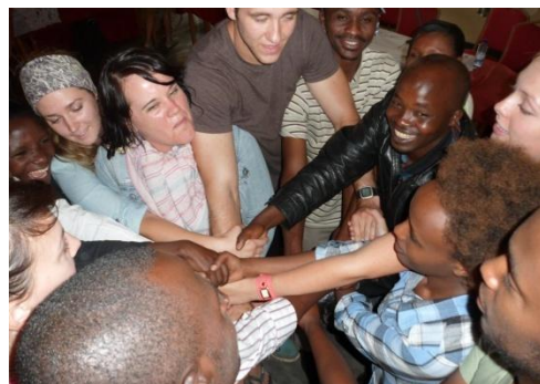
Delegates and Kiziba refugee youth during a communication exercise